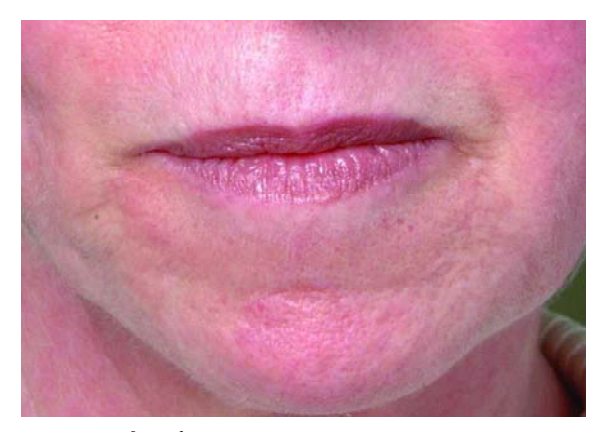
Four weeks after 1 treatment